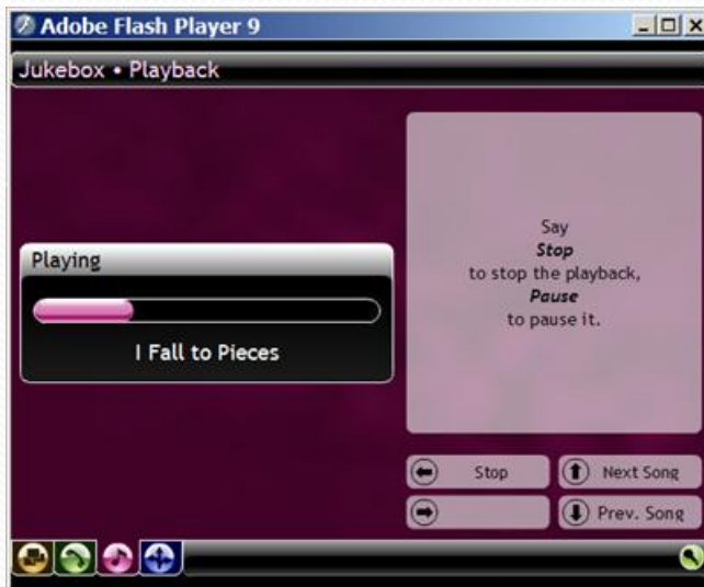
“Classical” Jukebox Interface